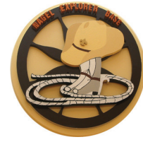
Nagel Base at Beaumont Scout Reservation