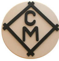
Camp May at Beaumont Scout Reservation