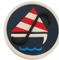
Swift Base at S bar F Scout Ranch