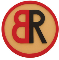
Beaumont Scout Reservation High Ridge, Mo.