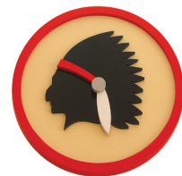
Camp Sakima at S bar F Scout Ranch