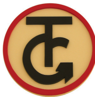
Camp Gamble at S bar F Scout Ranch