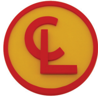
Camp Lewallen Silva, Mo.