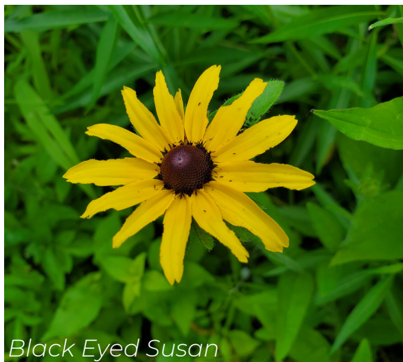
Black Eyed Susan